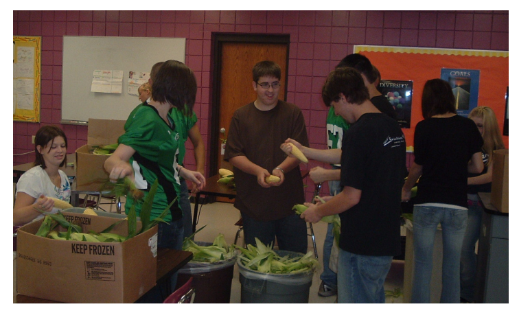
Several Family and Consumer Education classes helped to shuck the corn (lots of corn) for the corn feed during lunch on Monday, Sept. 14.